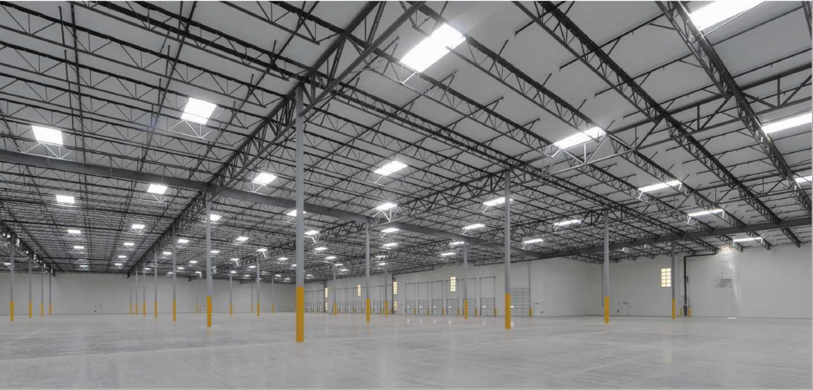
Image: Logistics facility in Fontana, CA featuring 150 SKYPRO 4x8 Unit Skylights. Contractor: KPRS