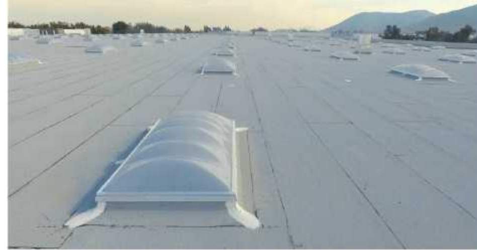
Images: Oakmont Logistics Center, Fontana, CA. 300 SKYPRO 4x8 Unit Skylights. Contractor: Mille & Severson