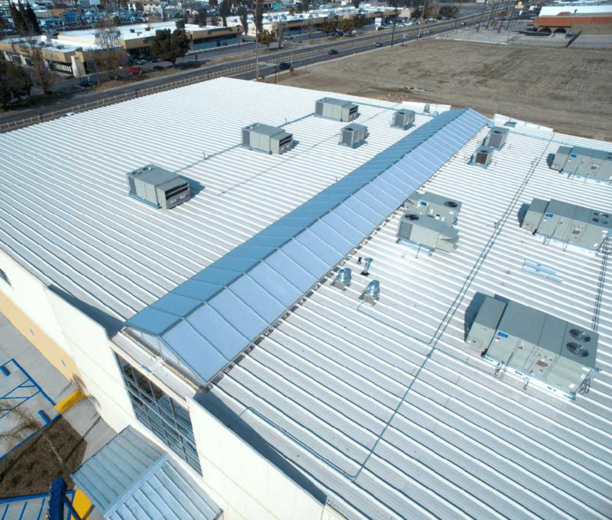
Image: Pearce Sports Center, San Bernardino, CA. 133'x16' Gable Ridge with 25mm Opal Triple Wall Polycarbonate. Contractor: Custom Curb