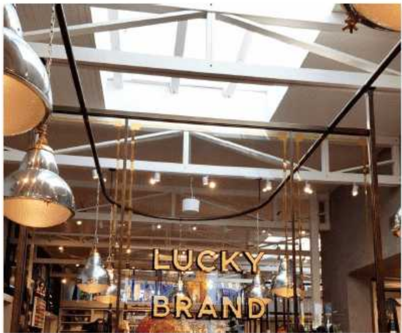
Images: Lucky Brands Retail Store at The Point in El Segundo, CA. One Structural Pyramid 10'x10' 5/12 Pitch with Solarban 70 XL Insulated Clear. One Gable Ridge 8'x16' 5/12 Pitch with Solarban 70 XL Insulated Clear.