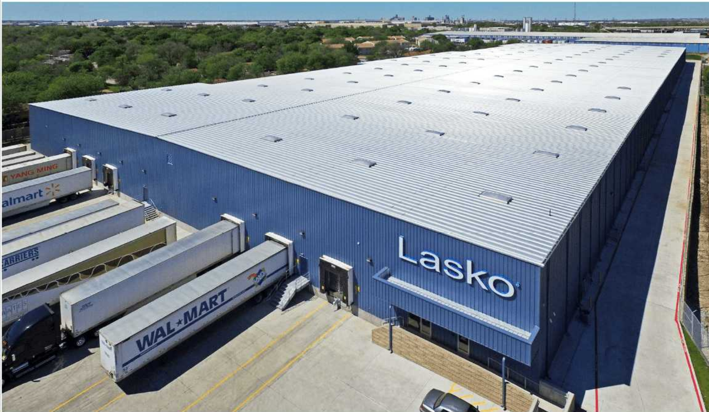
Image: The Lasko Distribution Center in Fort Worth, TX uses 90 Aluminum Curb Mount Frame SKYPRO Single Dome Skylights. Each unit skylight was set on Aluminum Varco Pruden Standing Seam Curbs manufactured by SKYCO Skylights. Contractor: Sedalco

Easy to install on all styles of roofs including metal roofing system.