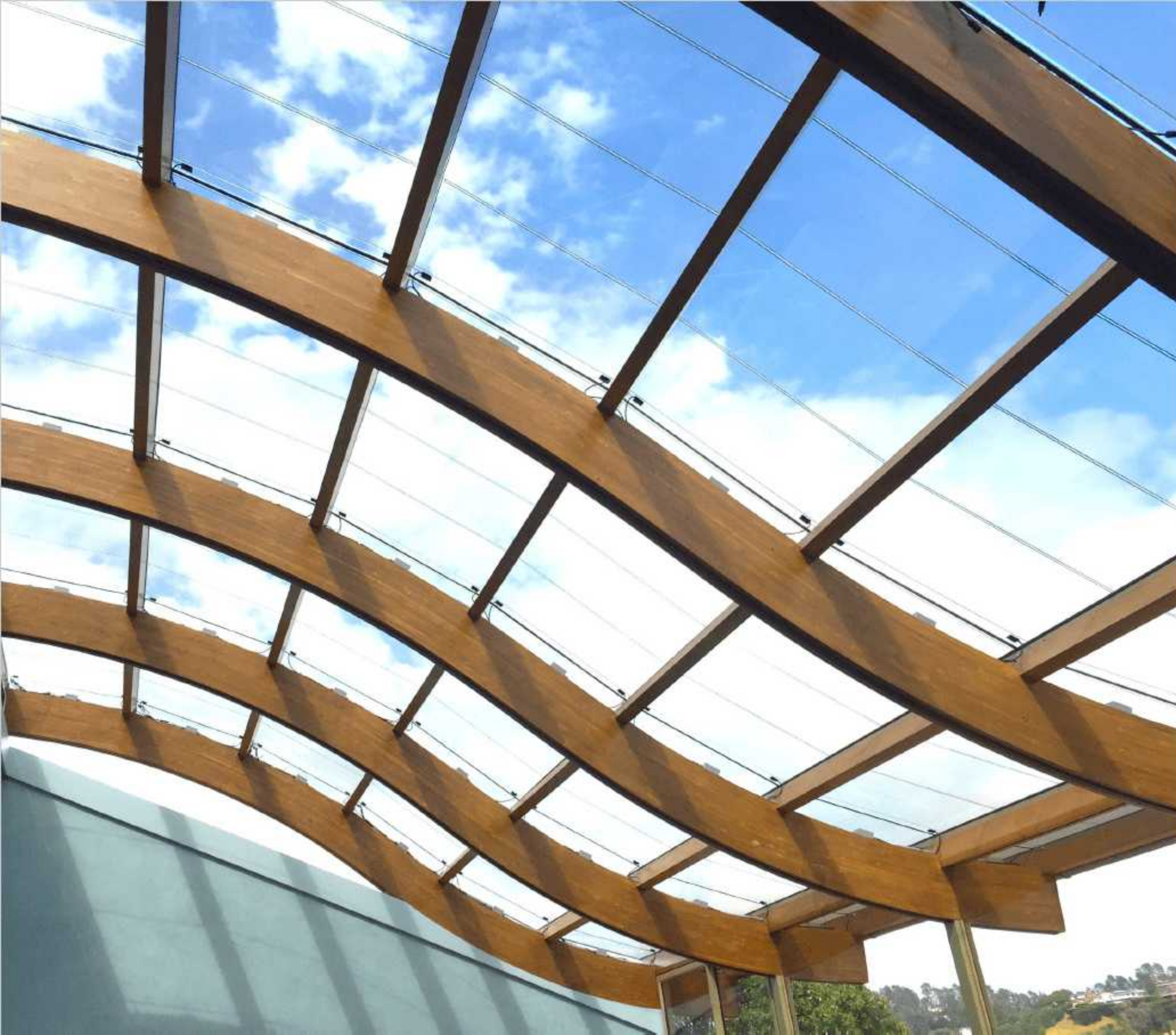
Image: Northern California residence featuring a unique SKYCO Skylights Photovoltaic canopy/sun room for an indoor pool.