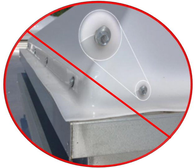
Typical result of a capless retrofit. Image shown is NOT a Skyco Skylights product.

Convert the skylight to a capped system, instead of repeating the design flaws of a capless system.