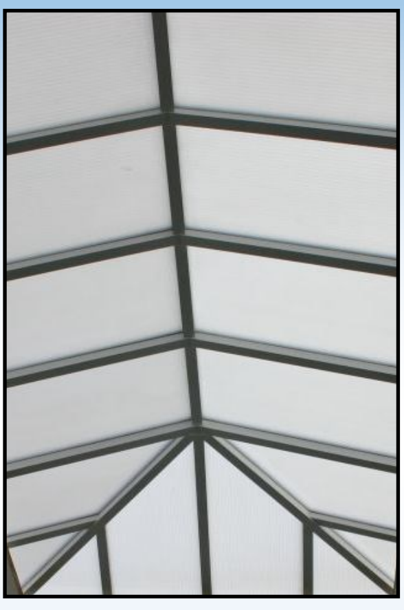
Skyglaze Translucent System

Which translucent glazing system has superior weathering performance? You be the judge!